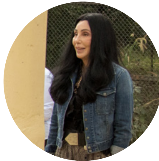
CHER Co-Founder & Trustee

FTW endeavours to stop the suffering of wild animals in captivity and ultimately find a way to release them into sanctuaries or better equipped zoos. Also assisting with the betterment of existing zoos and empowering its staff to care for and protect the animals in their care. We aim to provide education and support in terms of professional carers, handlers and vets and to introduce augmented and virtual reality into establishments as a replacement of some species, thereby ultimately eliminating animal trafficking.